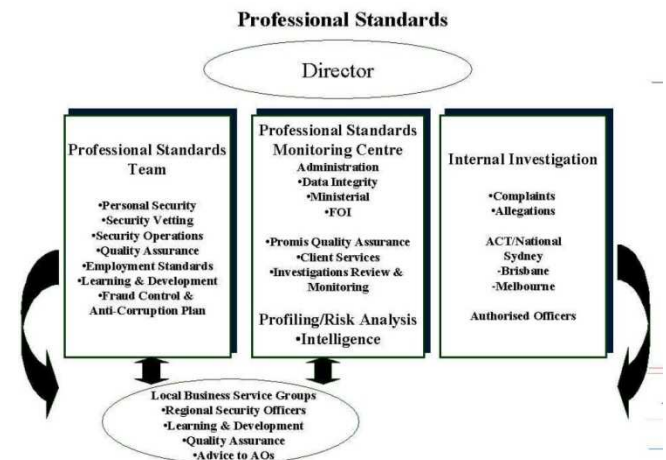
Fig. 3: HR Practices in the Knowledge Economy

learning-doing nexus. Also build knowledge value as an organizational as well as an individual asset; and Minimize the organization's knowledge risk associated with loss of requisite capability and knowledge.